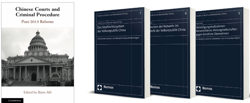
Figure 4: List of Publications

peer-reviewed journals in the field of Chinese studies such as China Quarterly, Modern China, China Information, The China Review, China and WTO Review, as well as in journals on international and comparative law such as the International Journal of Constitutional Law, Human Rights Quarterly or the Chinese Journal of Comparative Law.