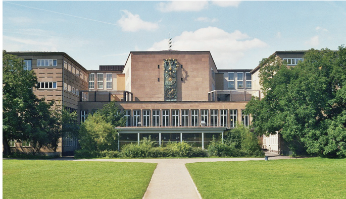
Figure 1: The University of Cologne's Main Building