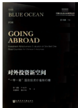
The Blue Ocean: Going Abroad

This book is one of the monograph series of the Grandview Institution - Chinese enterprises going abroad. It also takes into account global standards and Chinese factors to systematically rank the investment value of countries along the Belt and Road. Its research data was cited by CCTV’s “News Broadcast” in the “Counting the Belt and Road” section.