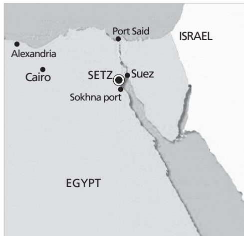
Figure 2: Suez Economic and Trade Cooperation Zone 22

The Suez Economic and Trade Cooperation Zone is located in the Northwest Special Economic Zone of Gulf of Suez, adjacent to Suez Canal. With a planned area of 10 km 2 , it contains a starting area (1.34 km 2 ) and an expansion area (6 km 2 ), which aims to build a good platform for Chinese enterprises to invest in Egypt. 23 It is implemented and operated by the Tianjin Economic Development Area (“TEDA”) under the auspices of the Chinese and Egyptian Governments. The Egypt-TEDA Investment Co., founded in 2008 in order to develop the zone with a total investment of USD 100 million, 24 is taking the lead for the investment, development, construction, management and operation of the Zone. 25